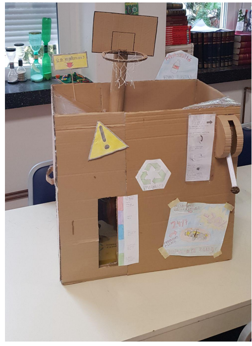
Creative paper collector