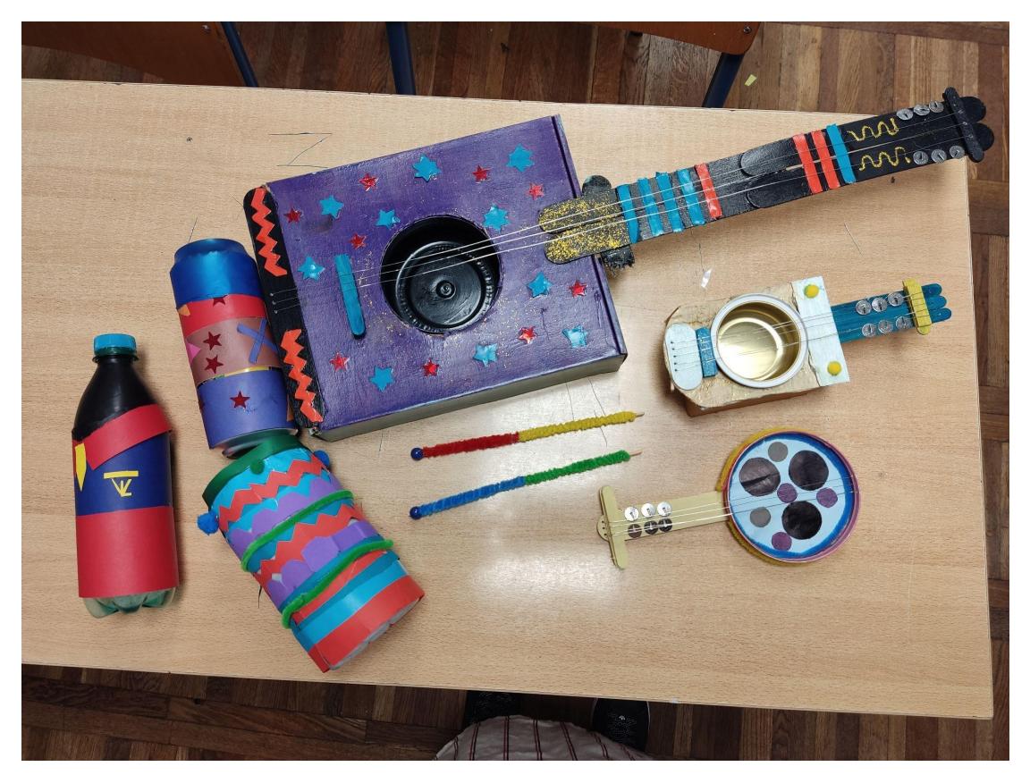
Upcycled music instruments