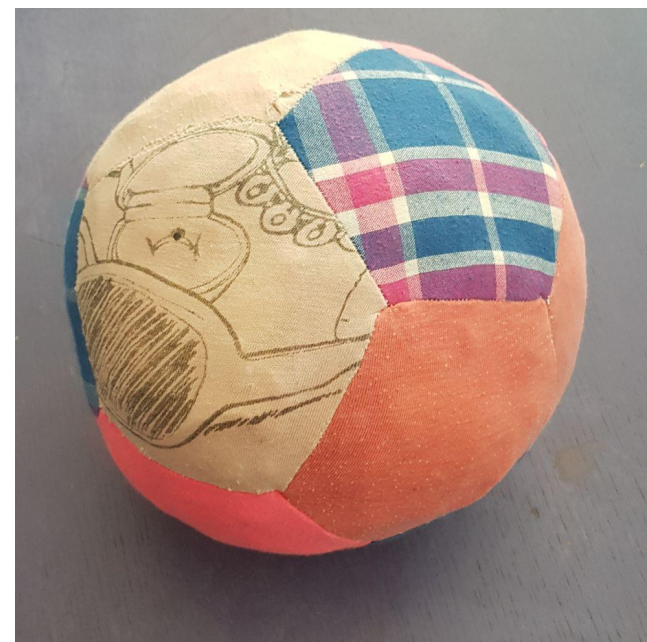
A ball made from old fabric